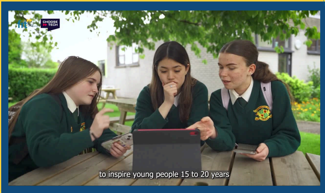
to inspire young people 15 to 20 years

PRESS PLAY TO HEAR FROM SOME OF THE FIT CHOOSE TECH STUDENTS!